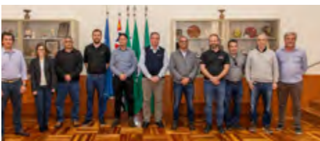
AgGateway LATAM August Meeting

AgGateway staff and volunteers travelled far and wide in 2025 to support AgGateway's mission. We gave presentations on our work to conference attendees, we collaborated with organizations and companies on specific initiatives, and we walked exhibit halls and hosted meetings to share our story and encourage membership. Below is a summary of key events and visits this past year (Cities are USA unless otherwise indicated):