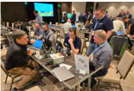
AEF Spring Plugfest