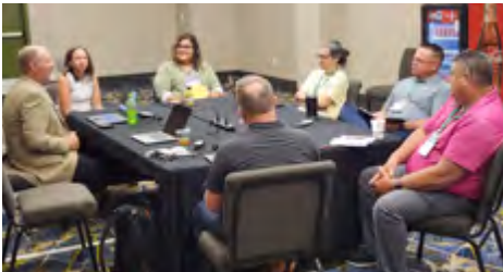
Tech Hub Live Conference and Expo