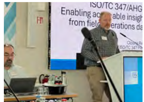
ISO TC 347 Meeting