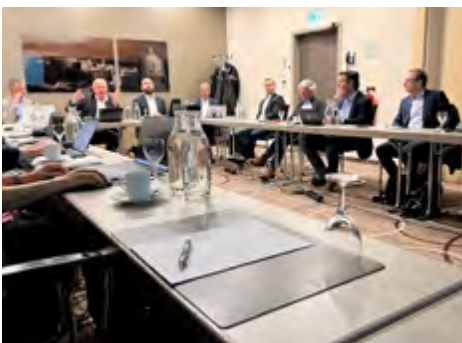
AgGateway Europe Spring Meeting