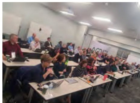
Entity ID In-Person Meeting